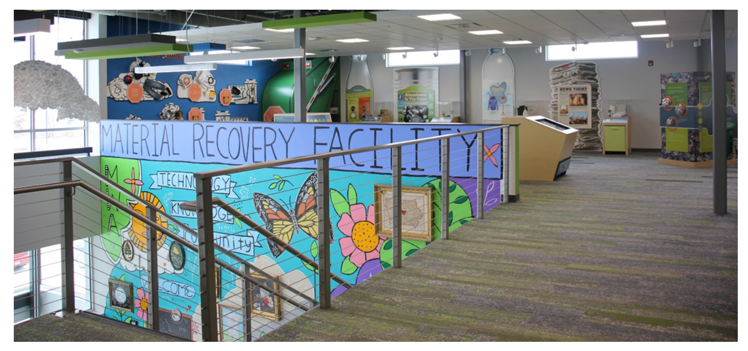
This photo shows the Education Center at the Metro Recycling Facility in Grimes, Iowa.

The best way to have a sustainable recycling program is to have an informed and engaged community. Metro Recycling Facility includes an Education Center and recycling exhibit to help the community learn about recycling.