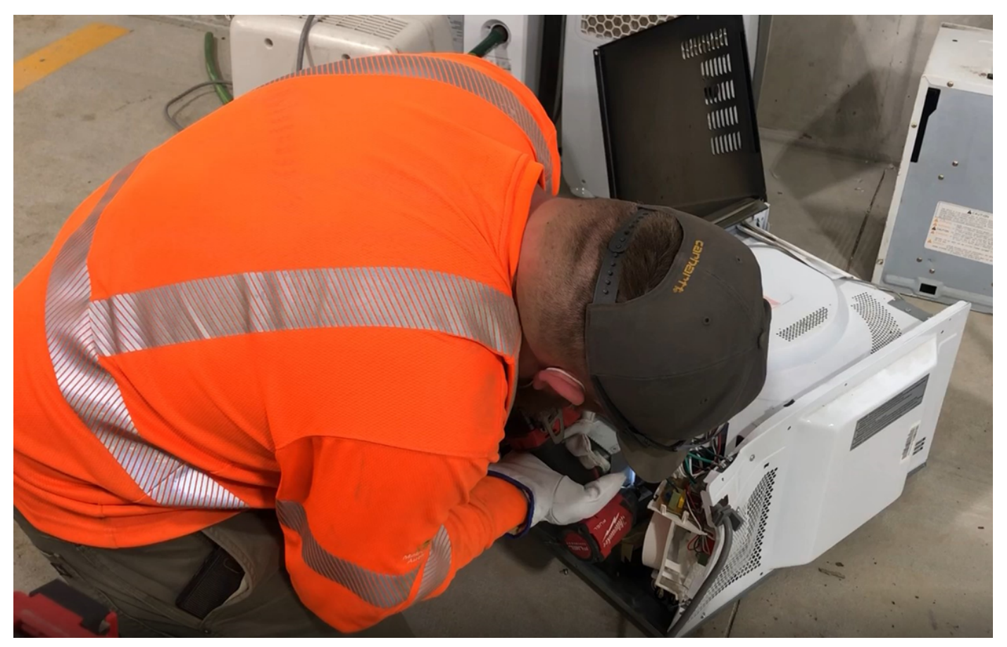
This photo shows a staff member demanufacturing an appliance.

Metro Waste Authority started a demanufacturing program in 2020, with a goal of keeping all appliances out of the landfill.