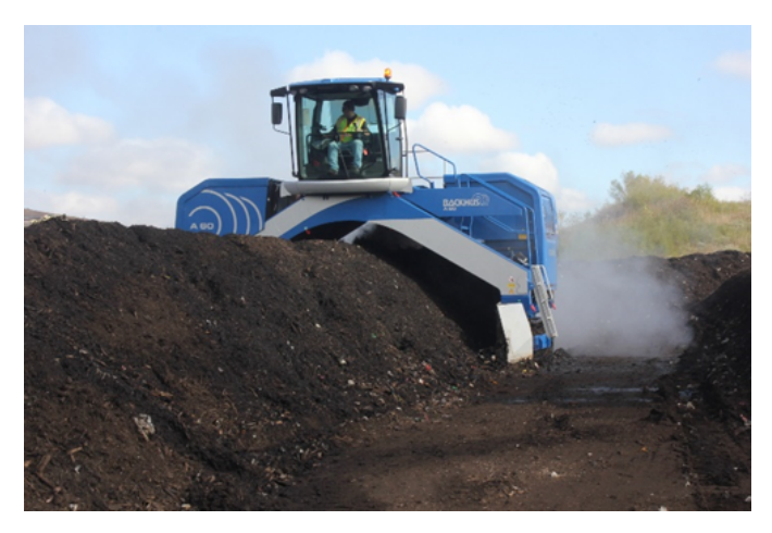
This photo shows Metro Waste Authority's windrow turner.