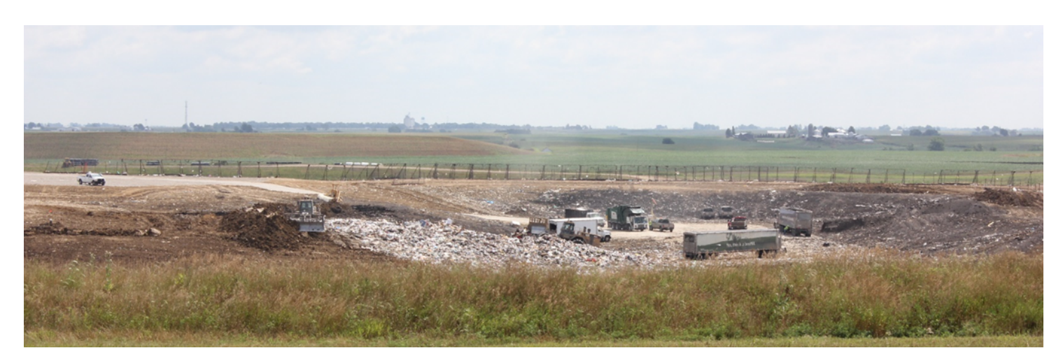
This photo shows trucks tipping off material at the working face.

The working face of a landfill is where garbage is currently being tipped, compacted, and buried. This is usually a very small area in comparison to the total square footage of the landfill as a whole.