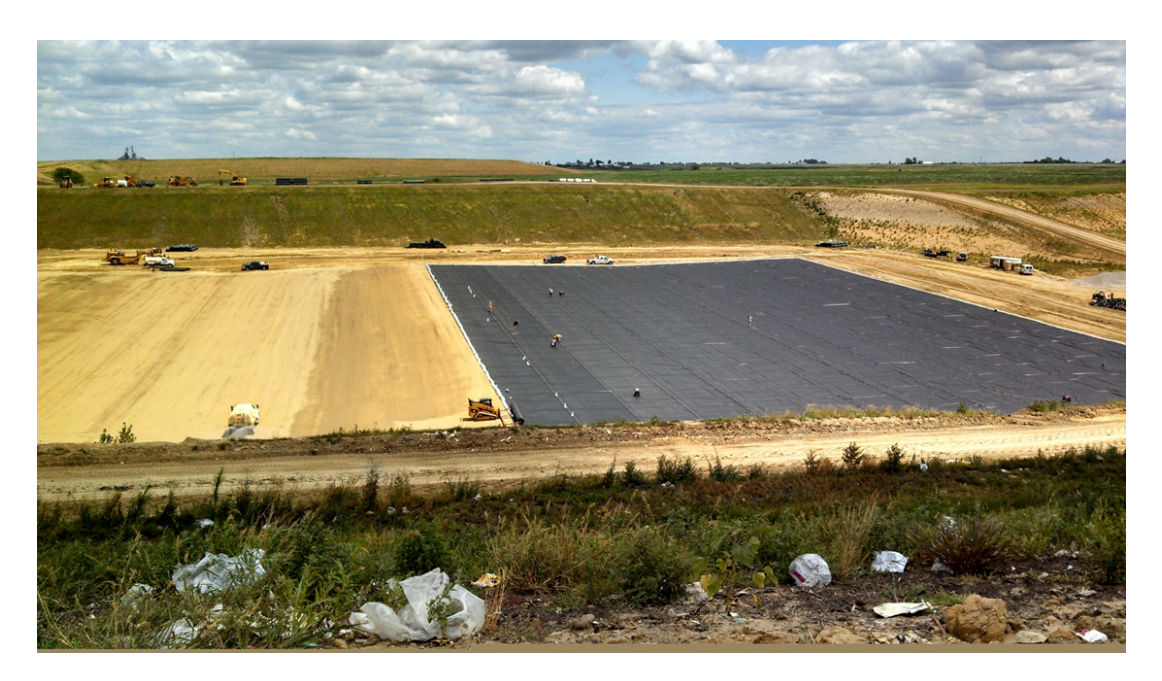
This photo shows the preparation of a landfill cell where garbage will be buried. In the photo, a plastic liner is being rolled out over layers of clay and gravel.

A landfill is a scientifically engineered and managed facility used to dispose of municipal solid waste. Unlike dumps, they are highly regulated and designed to protect the environment, including groundwater and air quality. At a landfill, material is spread in thin layers, compacted, and buried, eventually being "capped", which encloses the material inside. It is then covered with soil and planted, usually with tall grasses. Landfills are monitored for decades post-closure, meaning byproducts created in the closed landfill, like methane and leachate, are still properly managed after the landfill is closed.