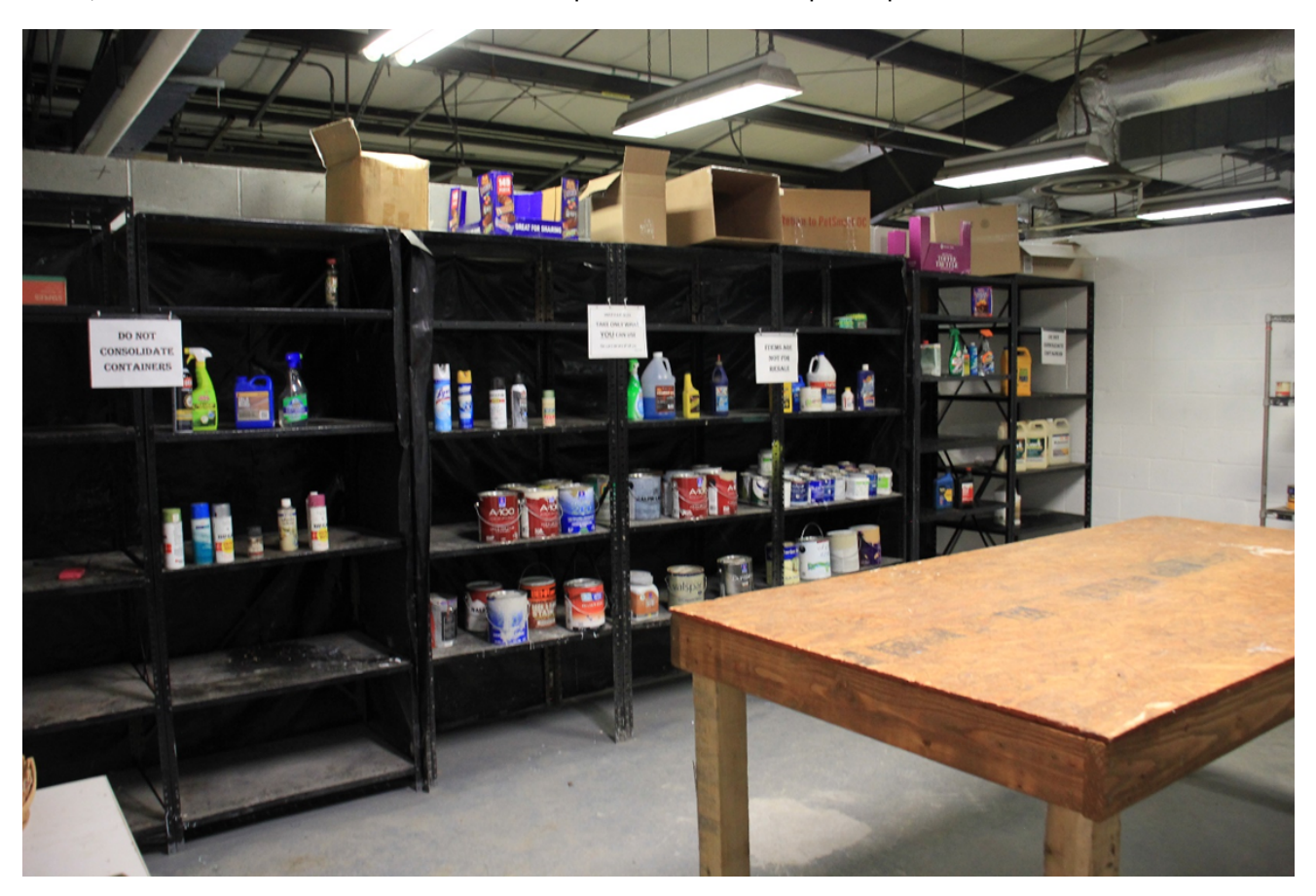
This photo shows the Swap Shop at the Metro Hazardous Waste Drop-Off in Bondurant.

Many hazardous materials, like paints or cleaners, are brought to the Metro Hazardous Waste Drop-Off before they are fully used. In fact, some are barely used at all! Because of our vision of "no wasted resources", these materials are offered to the public in our Swap Shop for free.