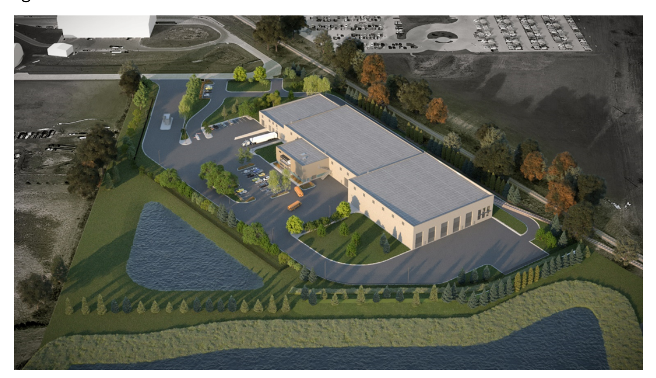
This rendering shows the Metro Recycling Facility in Grimes, Iowa.

Metro Waste Authority opened a world-class, state-of-the-art recycling facility in Grimes, Iowa in November of 2021. This facility is over 100,000 square feet and utilizes advanced technology to help support our staff of recycling sorters. The facility processes thousands of tons of recycling each month.